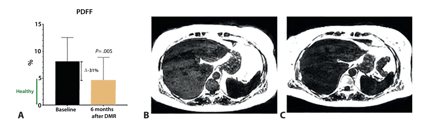
Figure 3. Magnetic resonance imaging (MRI)-based proton density fat fraction (PDFF) representing liver fat fraction in whole study population. Data represent median (interquartile range). A PDFF value below 5% is considered healthy. *P = .036. Analysis with paired Wilcoxon signed-rank test. Example MRI-based PDFF images at ( B ) baseline and ( C ) 6-month follow-up with PDFF in percentage. PDFF improved from 8.1% to 4.1%. T2-weighted images: water is black , fat is white .

reported. All patients tolerated GLP-1RA liraglutide therapy, and there were no episodes of hypoglycemia. Below we give an overview of the results of this feasibility study. The results are encouraging and surpass our expectations, but we must proceed with caution when interpreting the results given the small sample size and the uncontrolled nature of this study.